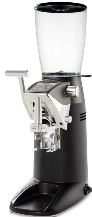
OPTIONAL DYN VERSION